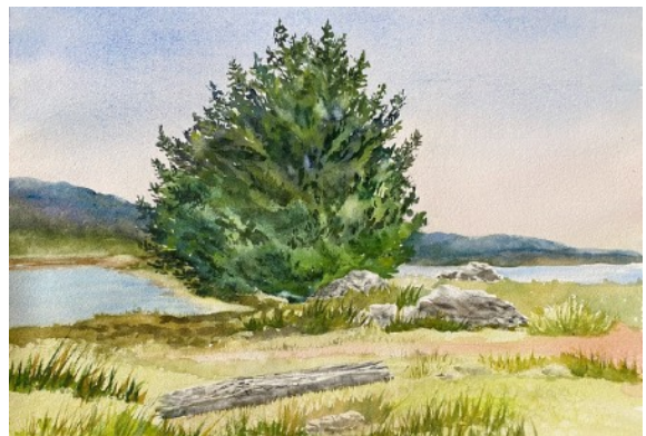
California Sentinel watercolor by Rose Scaglione