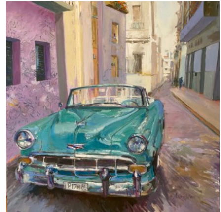
by Adele Grodstein

Adele Grodstein - Adele Grodstein's solo exhibit of oil paintings will be on view at the Piermont Fine Arts Gallery from February 29 through March 17. Adele will be present during gallery hours. (Th: 1-6, Fri: 12-8, Sat: 12-8, Sun: 1-6)