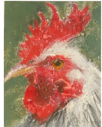
Bring on the Cluck image transfer with mixed media by Mary Walker-Baptiste

Artist Statement: I feel I am an “artist of all media” since I continue to explore new possibilities. Watercolor is one favorite, which includes the excitement of watercolor crystals, when they explode their colors. And alcohol inks provide endless wonder as I move them about on a mixture of smooth substrates.