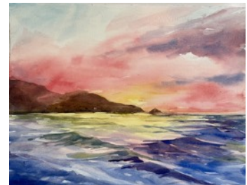
by Linda Barboni

Here is a good resource for mat boards: matboardhq.com